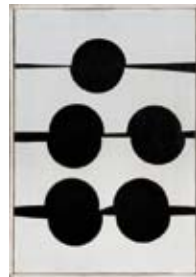
Manuel Calvo Sin título, 1963 Oil on canvas, 35 x 24 cm